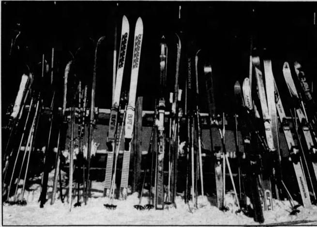
Skis at the ready at Mansfield's Snow Trails, which opened in 1961

Weekdays — 10 a.m. to 6 p.m., $9; night-time rate, $10 and $11. Weekdays and holidays — 8:30 a.m. to 6 p.m. or 3 to 11 p.m., $12; 8:30 a.m. to 1 p.m., $9; 10 p.m. to 4 a.m. Friday and Saturday nights, $10. Rental is $10 for 6 to 11 p.m. sessions and $11 for daytime or 3 to 11 p.m. sessions. Children age 12 and under, accompanied by an adult, get rental for $8 and $2 off chairlift prices.