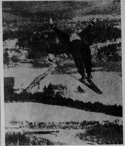
FLIGHT AND Freedom are the sensations experienced by skiers whose forte is jumping. Attaining speeds of 70 to 130 m.p.h. in a flight which may carry them as much as 300 feet through the air, enthusiasts claim that once you have enter-

Area residents who feel like trying the air of the bird in flight—with their feet on the ground or from one of four jumps—can now test their skimanship close to home this year—at the Norge Ski club. (A13)